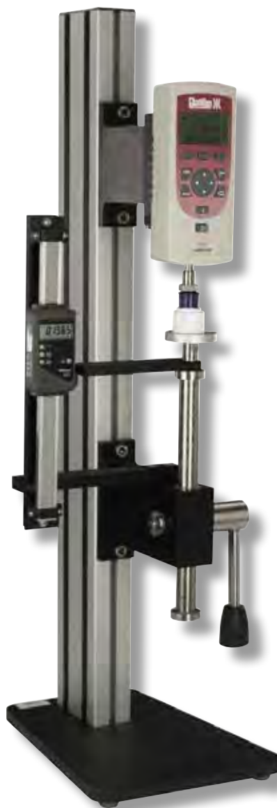
Shown: MT150L Series with optional Chatillon DFE Series digital force gauge and optional digital travel indicator.